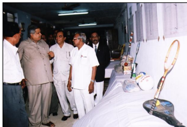
Guests are seen during the Exhibition of Sport equipments

It was a grand ceremony of sports meet which ran for three days. The Krida Mahotsava was concluded with prize distribution ceremony. Principal honourable