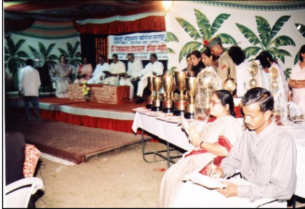
Ready for Prize Distribution ceremony of the Dr. Panjabrao Deshmukh Krida Mahotsava 2003.